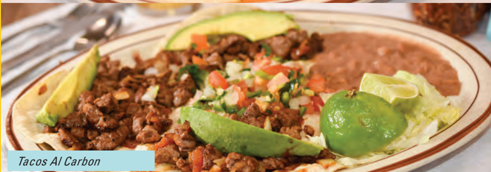
Tacos Al Carbon